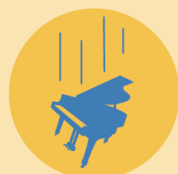
Flying or falling objects